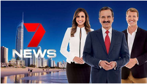
The 7 Gold Coast team

Our National & State News is sourced from AIR News (Australia Independent Radio News) and is heard hourly from 5am – 7pm